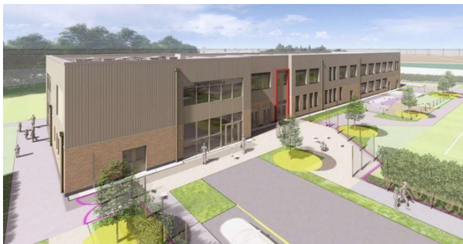
3D render of Hempland Primary School's new building due to begin construction early in the new year

Plans to construct a new two-storey building for Hempland Primary School have been unanimously approved by City of York Council's planning committee. Hempland successfully achieved a place on the government's School Rebuilding Programme which carries out major rebuilding and refurbishment projects in schools and colleges across England. The school's current building has reached the end of its functional life and will be completely rebuilt under the Department for Education led programme.