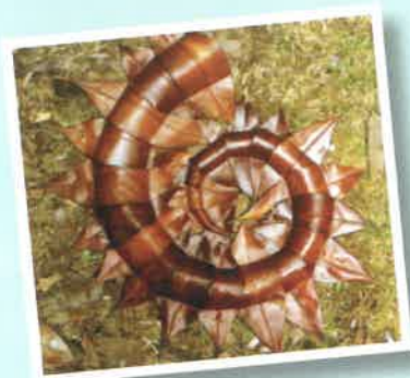
Leaves polished and greased, pinned to the ground with thorns.

Why don't you try making one next time you visit the coast?