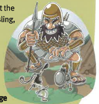
Bible story based on 1 Samuel 17

This was a day no-one would forget, when the courage of a shepherd boy saved a nation.